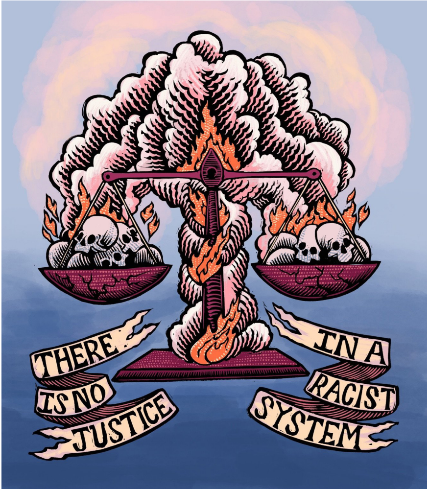
Roger Peet, 2020 justseeds.org